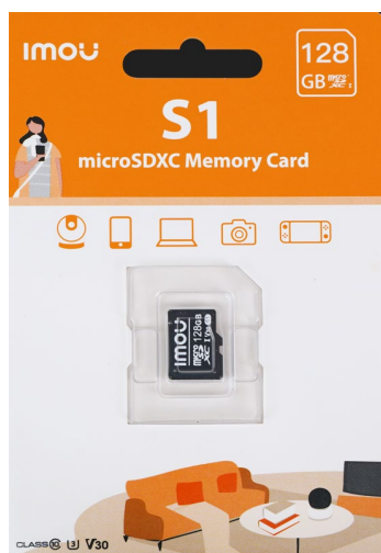
Front of the package