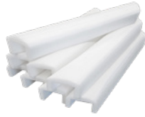
8 Foam Angles