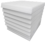
8x Foam walls