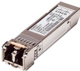
Figure 1. Cisco optical Gigabit Ethernet SFP module

The Cisco MGE transceivers provide fast, reliable connectivity between switches located on different floors, in separate buildings, or on a small campus network needing connectivity between sites. These transceivers can support Gigabit Ethernet applications. Figures 1 and 2 show the fiber-optic and copper transceivers. Table 1 lists the transceiver modules.