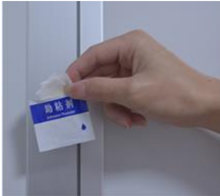
1. Remove the adhesion promoter.