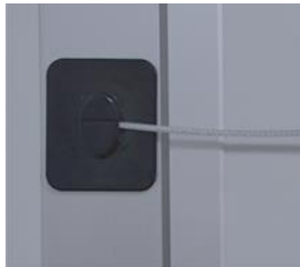
5. Coller la serrure sur le montant.