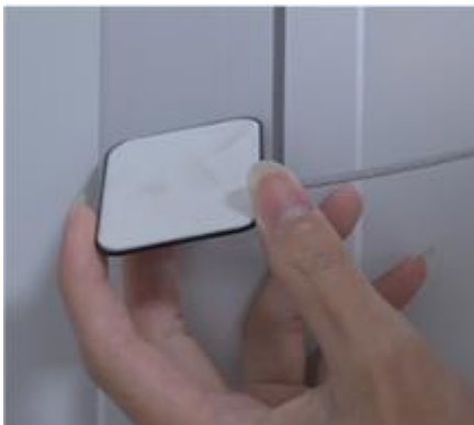
4. Visually check the position to be pasted.