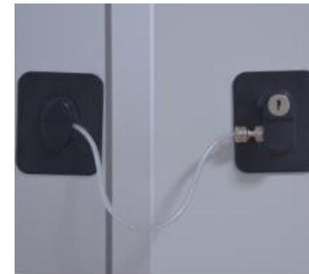
6. Press hard for 30 seconds.