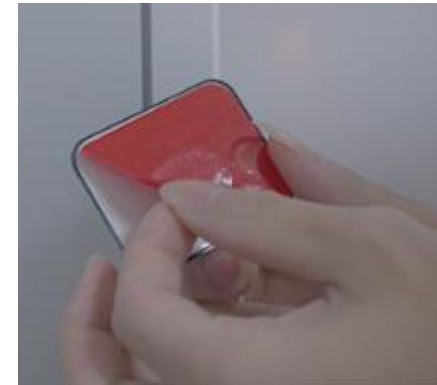
3. Tear off the protective film of the product.