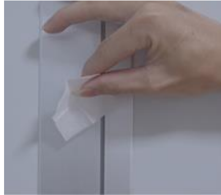
2. Nettoyer l'emplacement de la serrure.